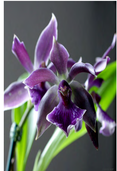
Bollopetalum Midnight Blue (representative photo, not actual plant from Show Table)