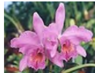
C. warscewezii (representative photo, not actual plant from Show Table)