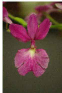
Calathea Rosea >

Don't forget to bring your blooming babies for all to enjoy!