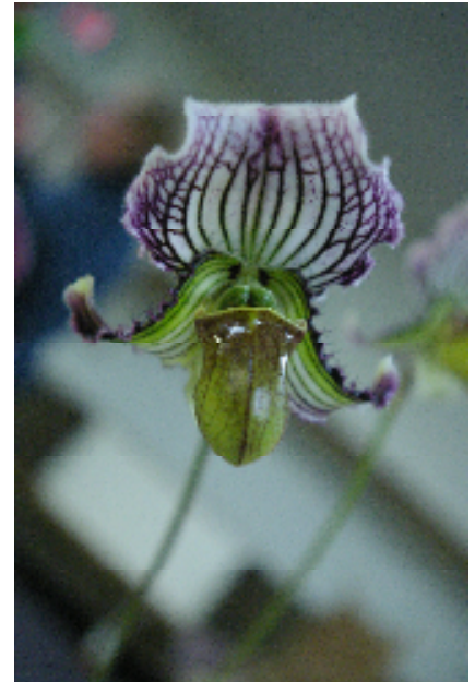
Paph fairrieanum