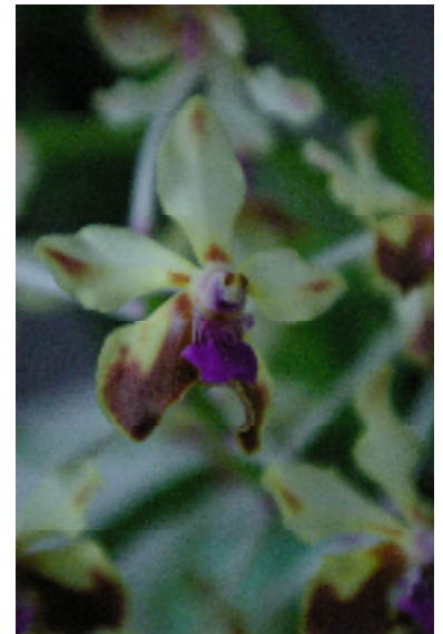
Vanda (lamellate X boxalii) Mary Ann Ulmann