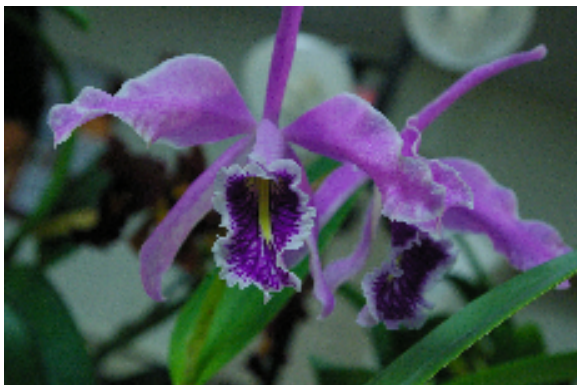
< Cattleya - maxima