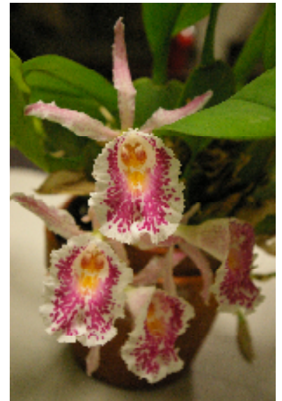
Tricopilia suavis - The Rao's