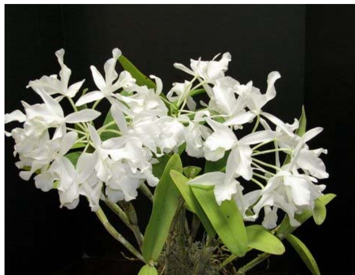
C. skinneri var. alba