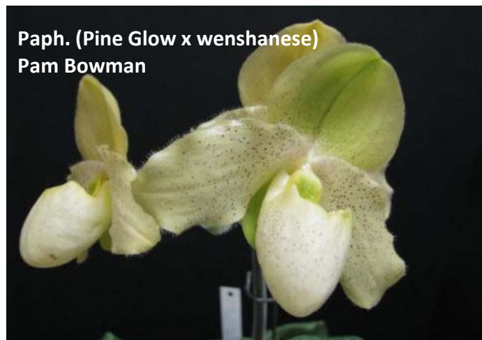
Paph. (Pine Glow x wenshanense) Pam Bowman