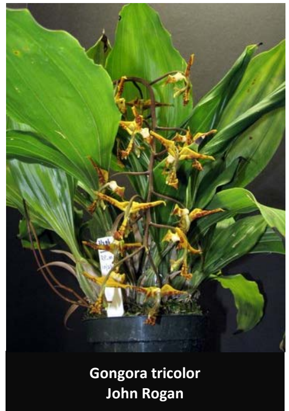
Gongora tricolor