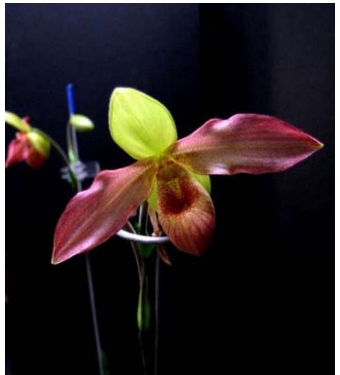
Phrag. Andean Fire 'Sol Fenick' AM/AOS Bee & Sol Fenick